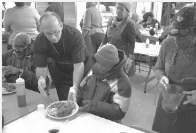
His Excellency serves meals at Basilica Soup Kitchen.

Welcome to the 2018 Annual Diocesan Appeal ~ Building Our Family of Faith.